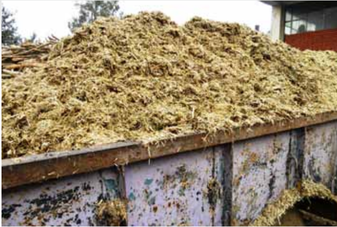
Photo 12. Sarson saag waste being transported by dairy farmer