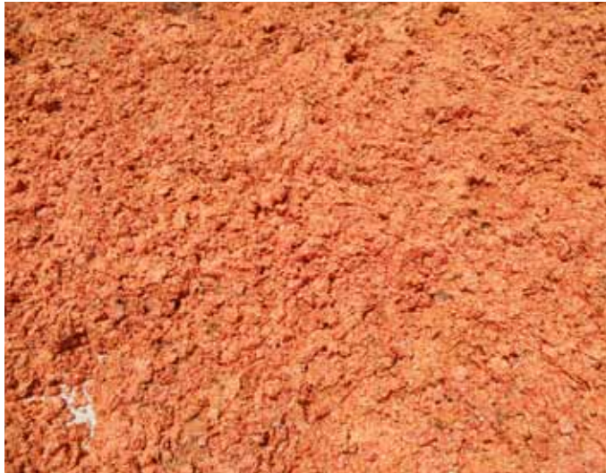
Photo 13. Tomato pomace being sun dried

of tomato and is fed after sun drying and grinding. Unripe tomatoes and the green parts of ripe tomatoes contain a solanine-like alkaloid (saponin) called tomatine that may be toxic to insects, dogs and, to a lesser extent, herbivores (diarrhea, vomiting, intestinal irritation). However, it disappears as the tomato ripens and is not a problem in tomato pomace.