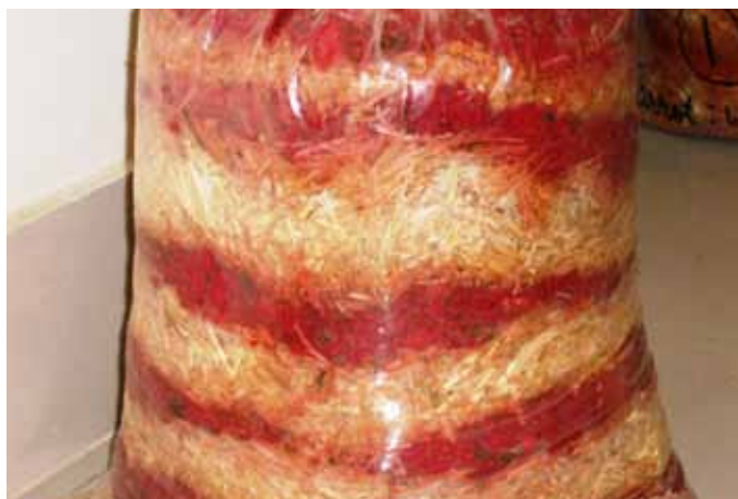
Photo 8. Alternate layers of carrot pomace and wheat straw ensiled in an LDPE tube silo

Non-ruminants: Citrus pulp silage can be included at 5–10 percent in the diet of growing pigs, which reduced the feeding cost. Pigs offered citrus pulp showed significantly lower Enterobacteria counts in faeces compared with pigs in the control group. However, no difference was observed in the Lactobacilli count (Cerisuelo et al. , 2010). Generally, increasing the amount of fermentable fibre in the diet stimulates microbial fermentation in the hindgut of pigs and fermentation generates lactic acid and volatile fatty acids, which are capable of inhibiting some intestinal pathogens e.g. Escherichia coli and Salmonella spp. (Montagne et al. , 2003). Feeding ensiled citrus pulp improved meat quality, without affecting growth performance (Cerisuelo et al. , 2010).