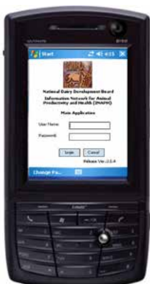
Photo 2 Personal Digital Assistants loaded with the ration balancing software

Based on our experience, it is evident that milk producers could be advised to balance the ration of their animals using locally available feed resources with the help of software developed by NDDB (Photo 2), using desktops, laptops or Personal Digital Assistants.